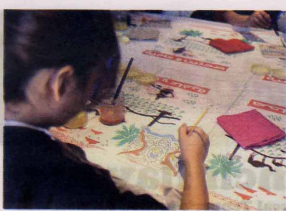
Ceramic tile workshop, ACF.