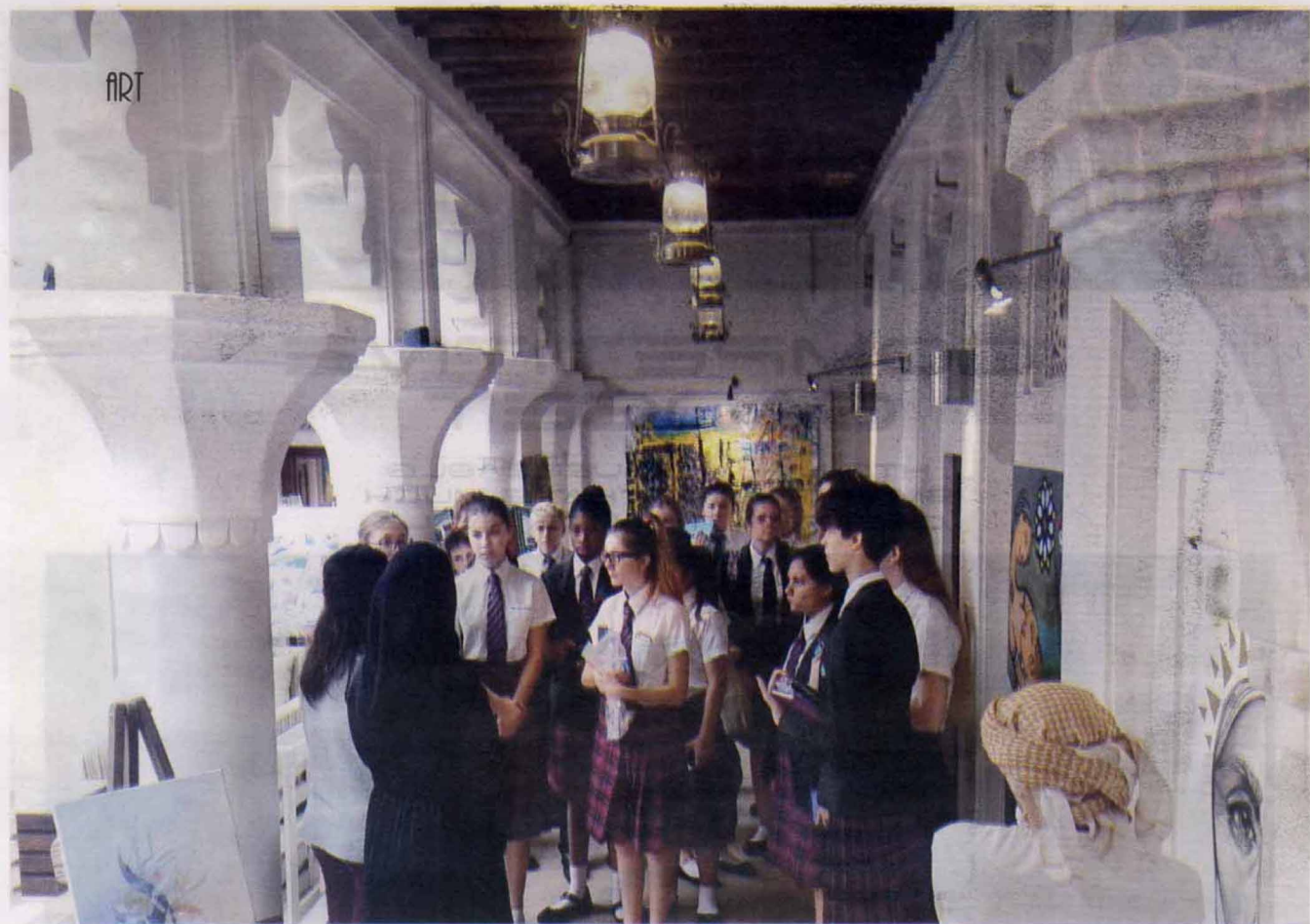
School hours at ACE.