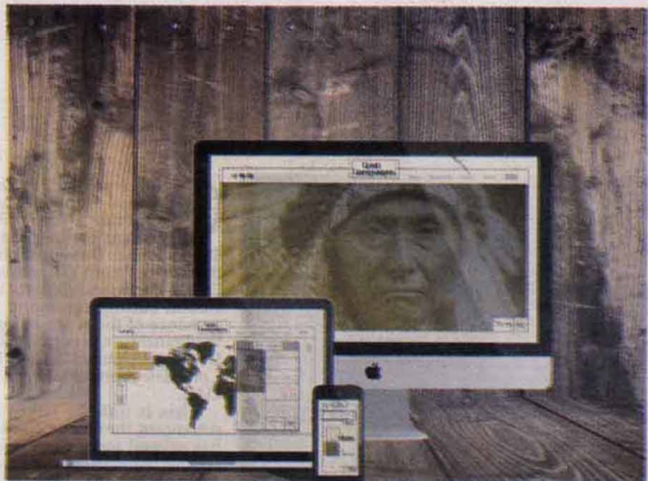
Lost Languages - The Loss of Words, Basma Ayman El-Noggar, GGS.