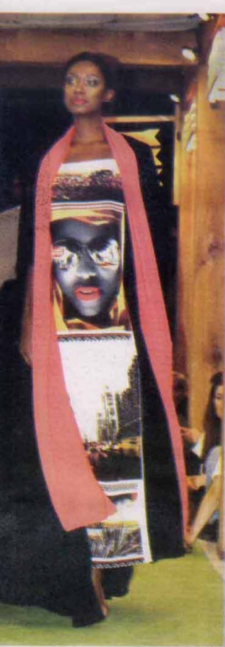
Fashion catwalk at ACF.